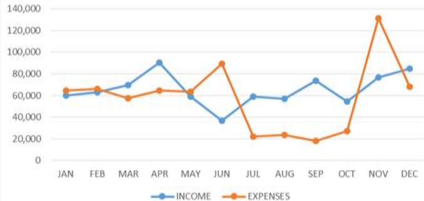
Income & Expenses by Month: Jan - December 2019

Cumulative we are up R88 000 for the year as at December 2020