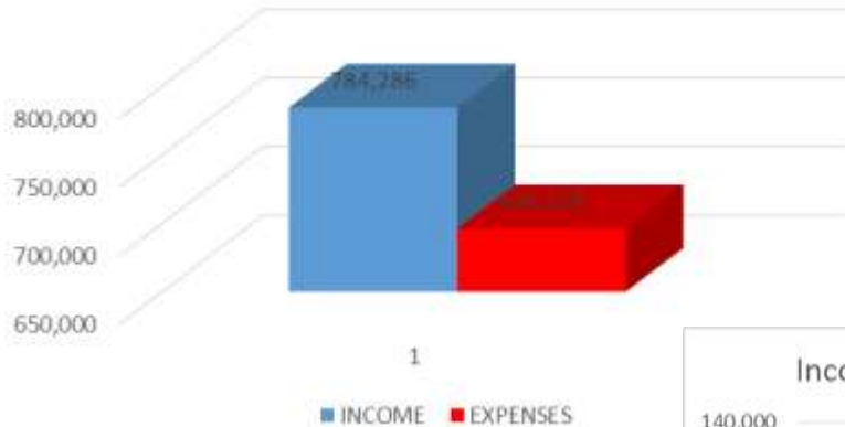
Income & Expenses Year to Date

Cumulative we are up R88 000 for the year as at December 2020